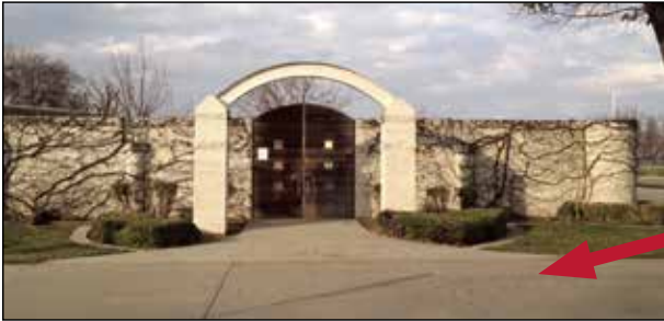
Wawona Courtyard Entrance (where children will be checked in and picked up each day)

Directions: Carpenter Road to Blue Gum Avenue - turn west on Blue Gum Avenue (Home Depot is on the corner). Turn onto the West Campus at the first right hand turn. Follow the road to the roundabout and turn left towards the grassy area - You will see the Wawona Center (pictured above) The Camps for Kids classroom buildings are located behind the walls - Wawona 1 and Wawona 2.